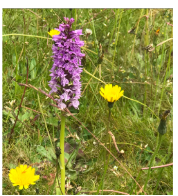
Reducing mowing rapidly re-generates flora to the benefit of wildlife.