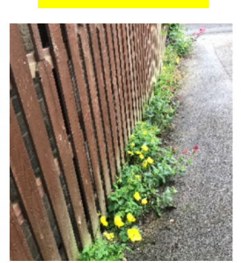
Herbicide use can be reduced with considerable benefits for biodiversity.