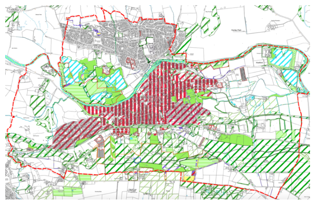
Work done by the Otley Nature Network so far.

Cost; quotes from local Ecology Consultancies will depend on the type of survey required.